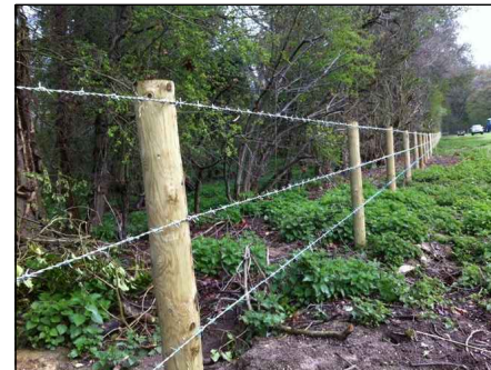
POST AND WIRE TYPICAL IAMGE