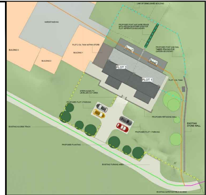
PROPOSED SITE PLAN (NTS)