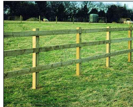
POST AND RAIL TYPICAL IAMGE